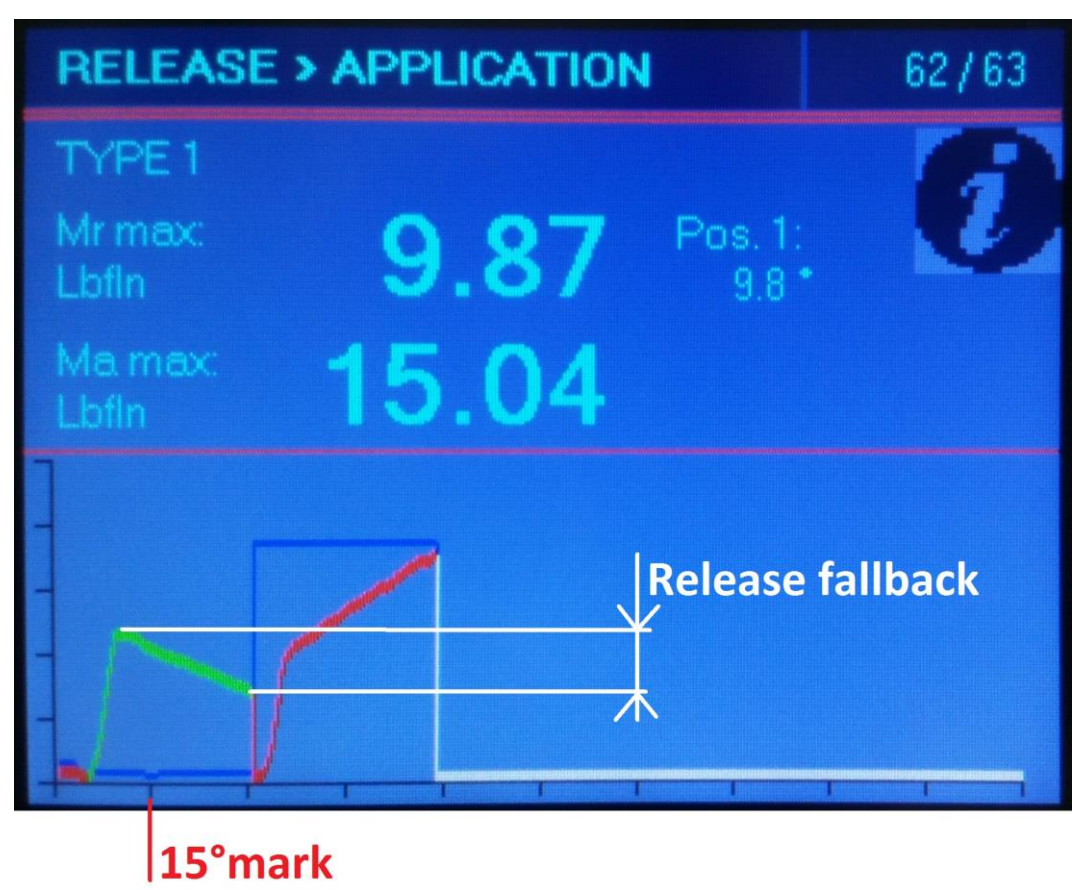
Figure 3 – Release>Application test with stop release on rotation

Both tests are bringing the same performance at most closures. Most customers use the test with " Release stop on fallback ", but by certain closures it is possible that finishing test on rotation may bring better results (for example if the initial fallback section of the graph is very flat).